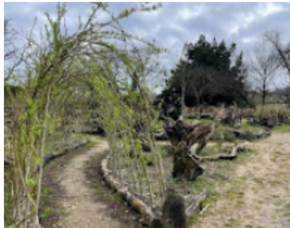
The Stumpery at Careys