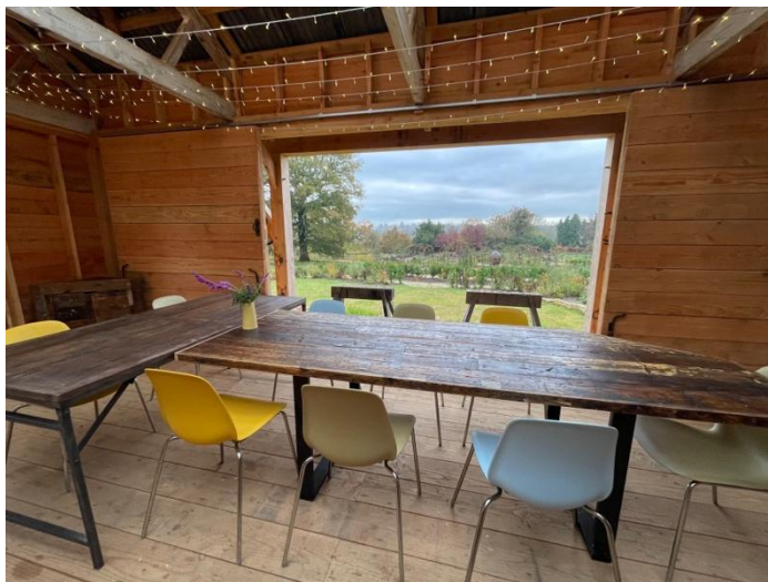
The Reclaimed Barn with lighting, tables and chairs