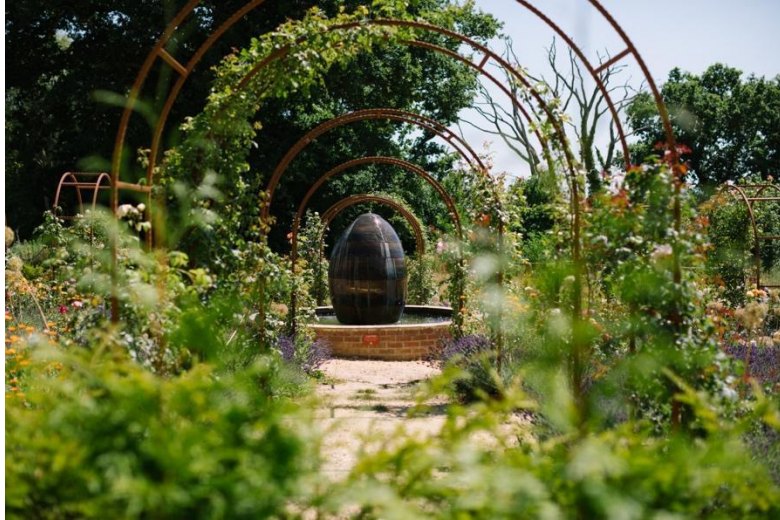
The Rose Garden at Careys