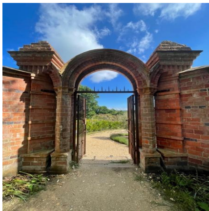
View of our main entrance