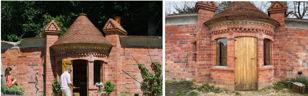
Exterior of the 'Potting Shed'