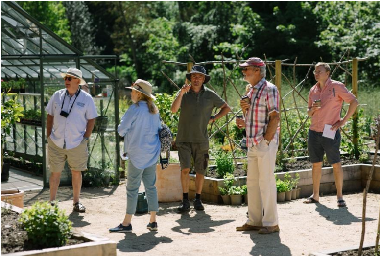
Garden Tour with Head Gardener