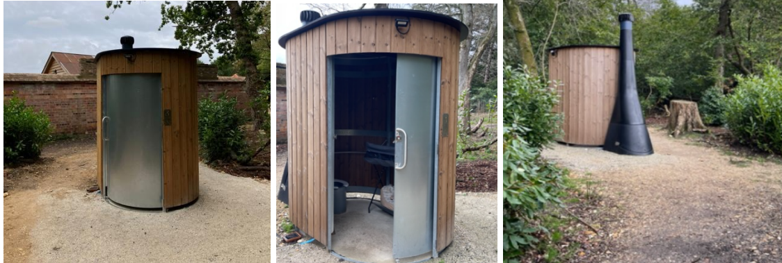
Accessible Waterless Toilet