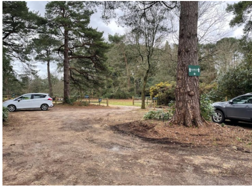
Secret Garden Car Park