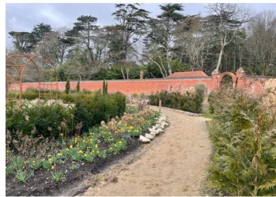
Pathways around the garden.