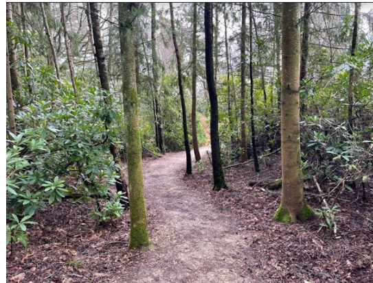
The pathway down from the carpark.